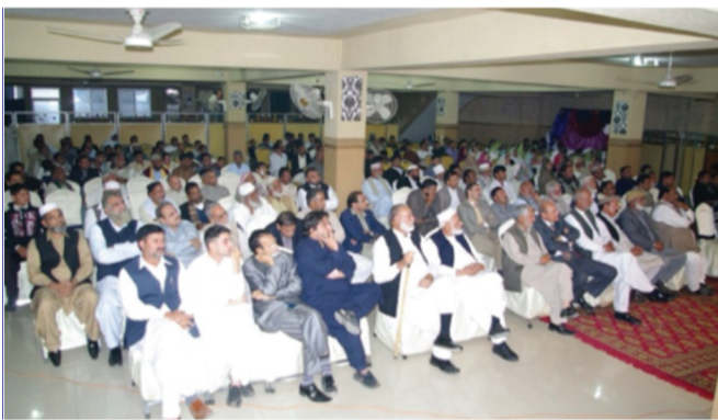
Guests hear how KORT helped so many people after the floods of 2014