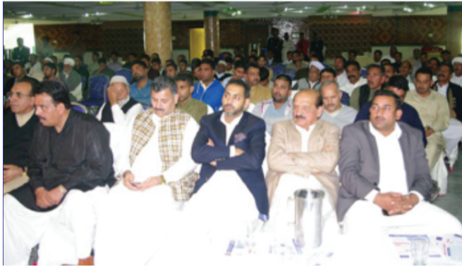
Guests listen at the Dudyal event

One of the worst floods in 20 years hit Kashmir in September 2014 and KORT was one of only a few NGOs able to help the needy victims. We provided aid, food, blankets and much more to hundreds of families to help rebuild their lives. Those affected were also very appreciative of the relief work KORT provided for them after the floods that hit their village in September 2014. Some of the families that received aid told of their stories and how KORT helped change their lives for the better after the devastation in their neighbourhoods. They would like to say a big thank you to the people of England for helping so wholeheartedly.