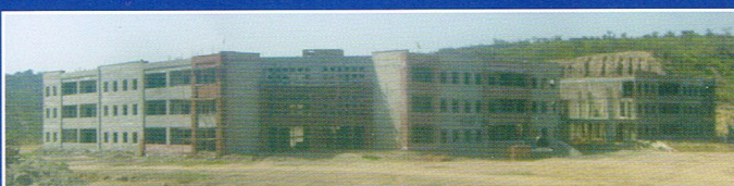
Progress of KORT's New Education Complex Picture Taken April 2013