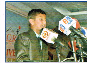
Children Presenting at KORT 7th Anniversary Event in Mirpur AJK and Naseed Performance