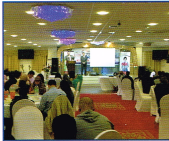
Birmingham Event with local support