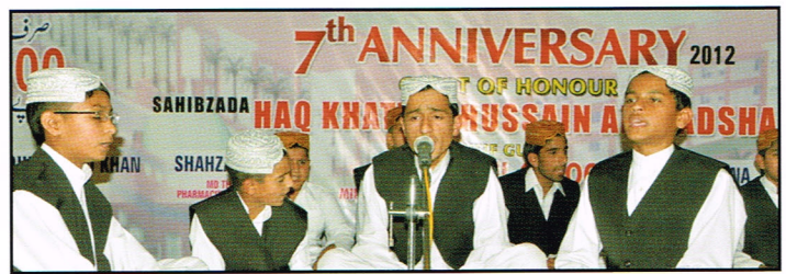
KORT boys singing Qawalis at 7th anniversary event

This expansion of KORT will enable us to generate additional funds from these regions and will further raise awareness.