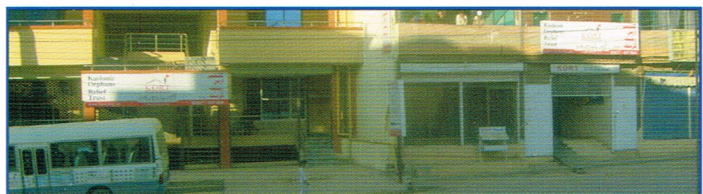
New home for the girls next to the existing KORT building

An additional benefit of this new provision is that we now have the capacity to accommodate 150 more children. We wish to thank Mobilink for their generous donation of a brand new IT lab for this new home for girls. (cont. pg3).