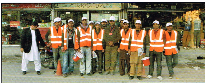
KORT Radiothon Volunteers AJK