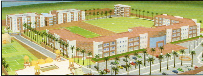
artist impression of new KORT Educational Complex

The artist impression below shows the educational complex at the site of the land generously donated by the Kashmir Government that has been completely transformed. The dream to build a home for orphan children has almost come true for everyone involved in this very ambitious and greatly needed project.