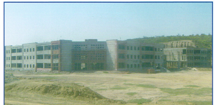
Latest Pic of the New Educational Complex taken 4/4/2013

We are happy to report that with your generous donations the construction of the educational complex is progressing swiftly. The school building structure (phase one) has been completed with over 40% of the plastering accomplished. The work on partitioning the classrooms is currently underway. Also, the mosque construction has been completed and approximately 80% of the roof laid, the remainder is scheduled to be completed shortly.