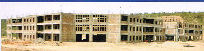
Progress of KORT's New Education Complex Picture Taken March 2012

You have the opportunity to join the brothers and sisters who have already sponsored a classroom as Eesal e Sawab for their loved ones. The name of the intended individual will permanently appear on a plaque outside the classroom (Further details on back page)