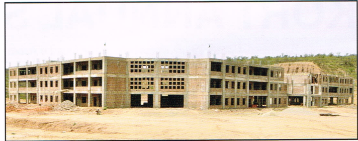
Phase 1: School Building nearing completion