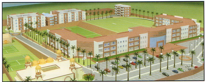
Full image of KORTs NEW Educational Complex

We would like thank the Banbury community for their continuous support of KORT especially the Banbury Mosque committee. Also the Manager of Sainsbury's for his support in allowing our local team to do a collection at the store.