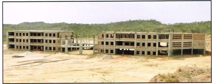
Phase 1: School Building nearing completion