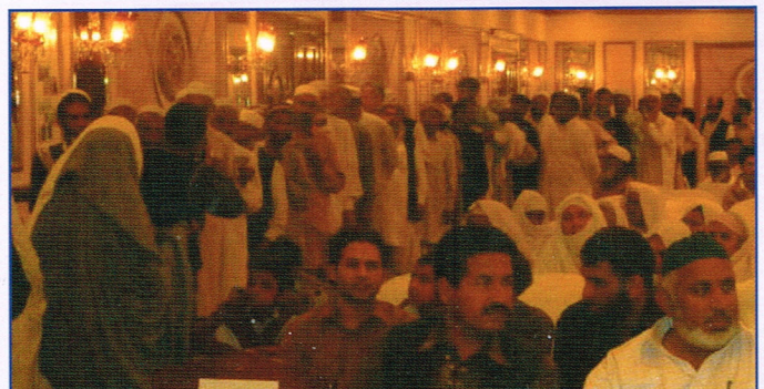
Nowshera key handing Ceremony Islamabad