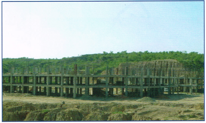
KORT Educational Complex work started on Third floor

Radio Appeals were held in Leicester, Burton-on-Trent and Derby and TV appeal on DM digital during Ramadhan.