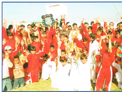
Winners: KORT Children celebrating Sports Festival