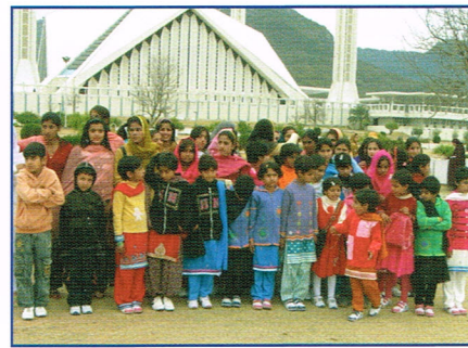
KORT Children at Faisal Mosque in Islamabad