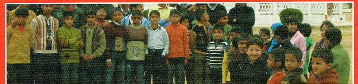
Boys and Girls of KORT - Please help us to make their dreams come true.