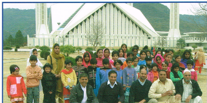
KORT Children and Trustees at the Faisal Mosque

The children, staff and trustees of KORT, visited the Faisal Mosque in Islamabad recently. The day out was thoroughly enjoyed by all. Children learned about the significance of the historical mosque. The trip also included visit to the Zoo and Rawal Lake for a stint of boating.