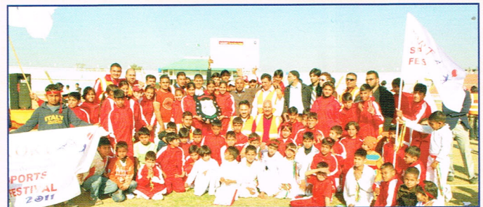
KORT children collect their overall team winners trophy

We would also like to thank all the volunteers, supporters and those too numerous to mention individually who helped make this event a most memorable and thrilling experience for everyone.