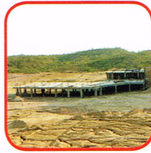
Phase 1: KORT School Building