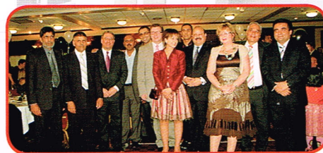
Caring Bradford Dinner including KORT Chairman, patrons and invited guests from AJK