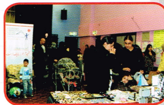
Charity Bazaar at the Highfields Centre, Leicester, 7th March 2009

Other fund raising events, including Iftaar parties are also planned. For further information please check our website.