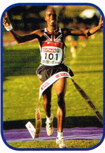
Mo Farah British and European 3km Champion

LOOK OUT FOR, Mohammed (Mo) Farah who will start the KORT 5k Fun Run on 27th September, compete for team GB in the forthcoming World Athletics Championships in Berlin, 15-23 August 2009