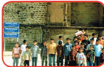
KORT Girls and Boys at Qila Rohtas