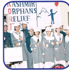
KORT Children on Earthquake Remembrance Day (8th October)