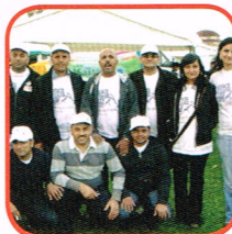
Team KORT and Volunteers at the Newcastle Mela