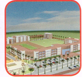
Artist's view of the KORT's New Educational Complex

PLEASE DONATE GENEROUSLY TO HELP US ACHIEVE THE COMPLETION OF THE CONSTRUCTION OF THIS NEW EDUCATIONAL COMPLEX FOR ORPHANS IN MIRPUR.