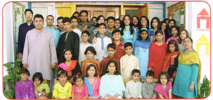
City School Mirpur pupils and staff with the children of KORT