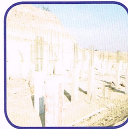
Pillars on firm foundations

We Would like to thank REKON CONSTRUCTION , of 47/48 Quaid-e-Azam Stadium, Mirpur AJK, for their support and assistance towards the design and construction of our project.