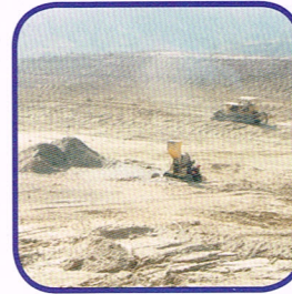
Ground leveling in progress