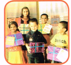
Children of KORT with Eid gifts

We guarantee that 100% of your donations will be used for the education complex welfare and education of the children.