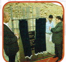
The stone laying ceremony