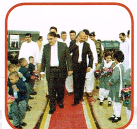
Chief Justice, Chair of KORT and Guest arrive