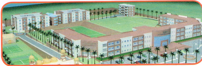
Artist view of the KORT's New Educational Complex

The past three months have been extremely busy for the KORT Team and its supporters, organizing a range of awareness/fundraising events in cities and towns across the length and breadth of the UK. The construction work has begun on the main block of the new educational complex, whilst the leveling of land still continues in earnest.