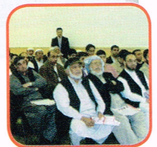
Awarness Seminar in Halifax