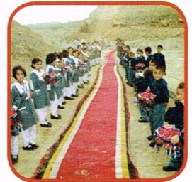
Children awaiting arrival of Chief Justice on new site