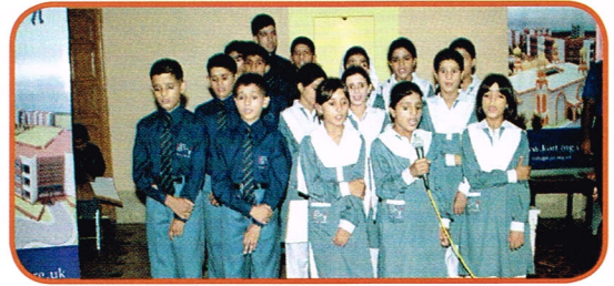
Children Performing at Stone Laying Ceremony