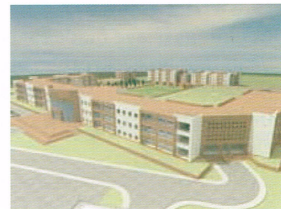
KORT complex in Jarrikas visualisation (above) and the construction so far (below)