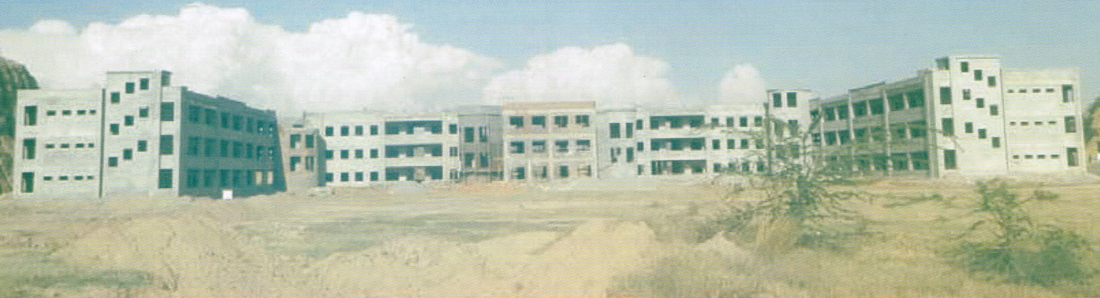
The KORT Complex so far